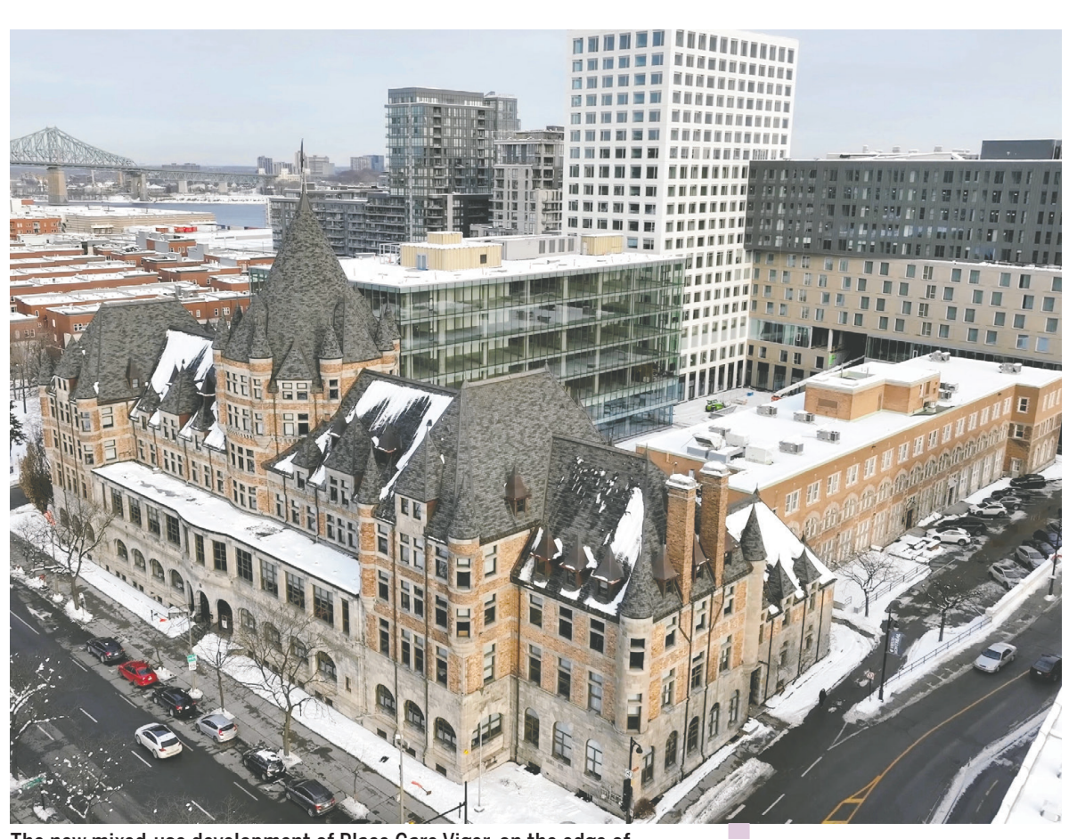
The new mixed-use development of Place Gare Viger, on the edge of Old Montreal, is an architectural triumph with offices, rental apartments and shops. HYATT CENTRIC VILLE-MARIE MONTRÉAL

The lobby is an appealing collection of eye-catching curves the walls, windows and furniture are all rounded. Designed by Ivy Studio, it's polished, grace-